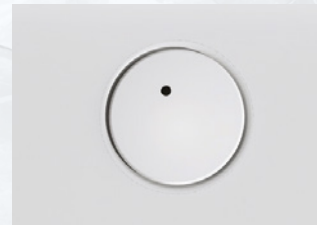
Chrome Dome Waste Cover detail